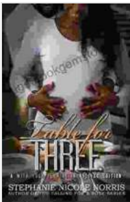
Table For Three: A With Your Permission Holiday Edition (In The Heart of A Valentine Book 11)

As the holiday season approaches, the air fills with love and romance. Valentine's Day, in particular, is a time to celebrate love and intimacy. However, it's important to remember that even during the most romantic times of the year, consent is paramount.