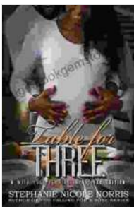
Table For Three: A With Your Permission Holiday Edition (In The Heart of A Valentine Book 11)

For more information about With Your Permission, please visit our website at www.withyourpermission.org .