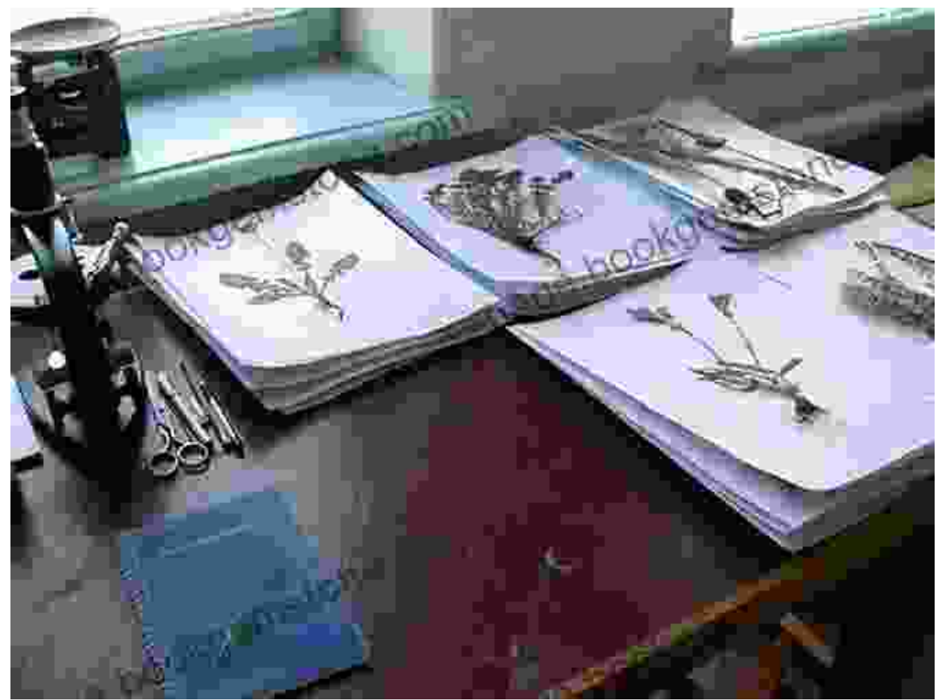
The Significance of Sustainable Art

The Herbarium Mega Square is a celebration of the contributions made by herbaria to our understanding of the natural world. Byrne's artwork pays homage to the meticulous work of botanists and herbarium curators who have dedicated their lives to documenting and preserving plant specimens for posterity.