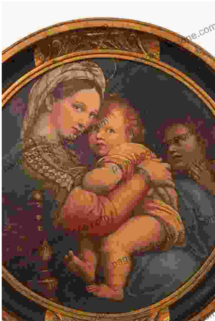
Renaissance painting of the Virgin Mary and Child

During the Renaissance, artists such as Leonardo da Vinci and Michelangelo sought to revive the classical ideals of beauty and harmony. They emphasized the importance of perspective, anatomy, and realism in their works. The Enlightenment period saw the rise of rationalism and individualism, which led to a shift in artistic focus towards the exploration of