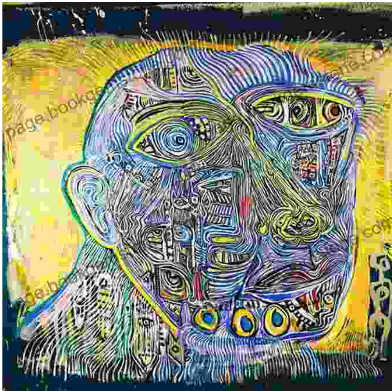
Postmodern painting of a fragmented image