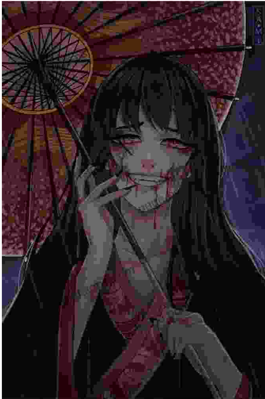
The chilling kuchisake-onna, a vengeful ghost with a grotesque smile, as depicted in Hyakkai Zukan

hundred illustrations depict a nocturnal parade of spectral figures, each with its unique attributes. From the ethereal form of the faceless Aosaginohi to the tormented spirit of the kuchisake-onna, or "slit-mouthed woman," Sekien's artistry gives form to the unseen, revealing the hidden terrors that lurk in the shadows.