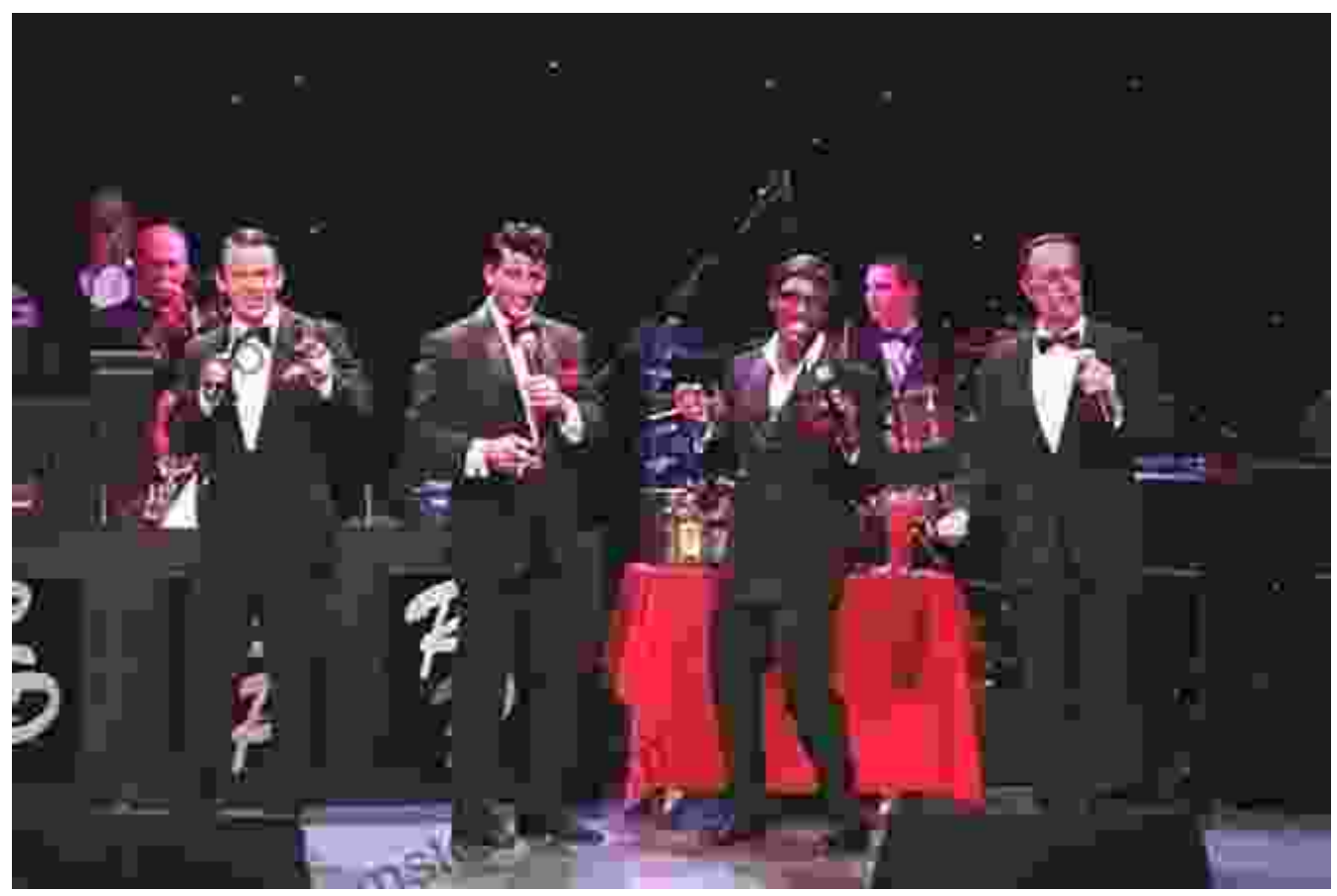
Behind the Scenes: A Life of Glitz and Glamour

Together, the Rat Pack was an unstoppable force in the entertainment world. They starred in a series of hit movies, including Ocean's Eleven (1960), Sergeants 3 (1962), and Robin and the 7 Hoods (1964). Their live performances at the Sands Hotel and Casino in Las Vegas were legendary, drawing sell-out crowds and rave reviews.